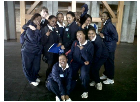
The Grade 11s in tracksuits