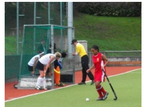
"Shorty!": 1st Team prepare for a short corner

On Saturday 7 May we tackled Alexander Road High School on a much awaited series of hockey games. Although we didn't win, the spirit, enthusiasm, tenacity and good sportsmanship shone throughout our girls' matches. We showed everyone what we are really made of.