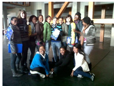
The Grade 11s who attended the Schools' Festival