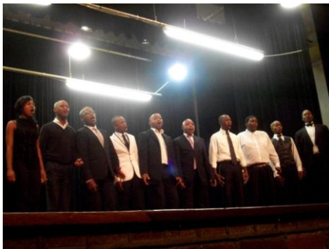
The Ten Tenors Concert