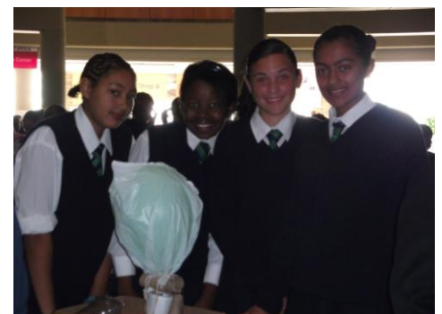
Some of the Grade 9s at SciFest