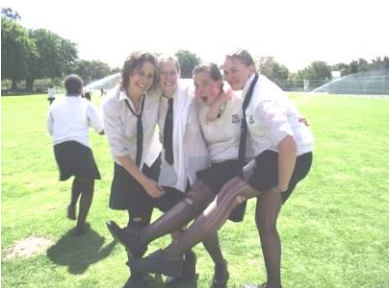
Traditional Valedictory sprinkler madness hit us once again.